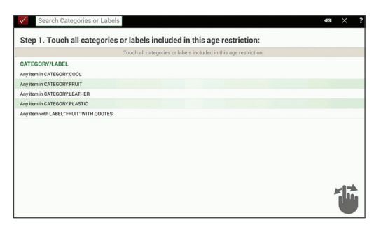
Select categories or items with specific labels to be age restricted

Quickly create age restrictions on various categories and labeled items. If the consumer is underage, restricted items are automatically removed from the ticket. If the consumer is age verified, the order is permanently stamped with a record of the date/time and information used to verify the age. All Clover devices owned by a merchant are automatically synced with one another.