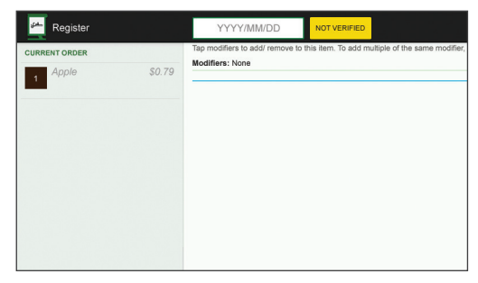
When age restricted items are purchased, the clerk is automatically notified and prompted for birthday information