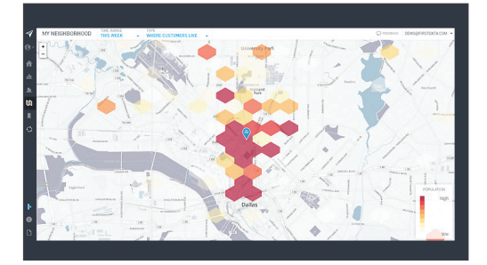
Understand where your customers are and where they shop so that you can better focus your Marketing efforts