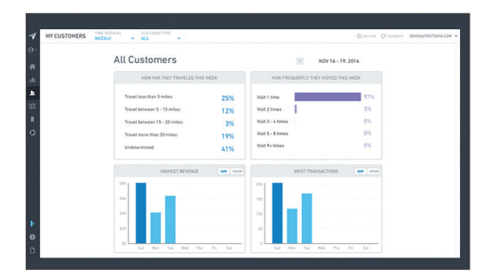
Get profiles of your customers by categories like new, repeat or local – so you can market more effectively