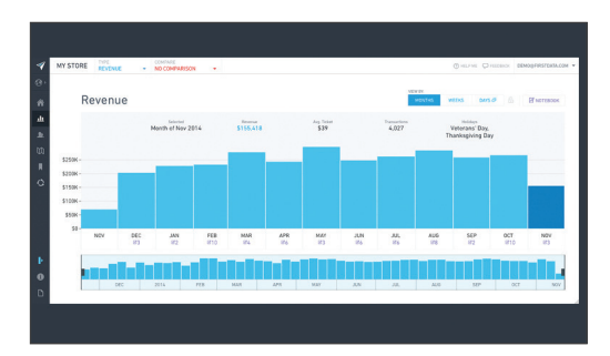
View your total sales on a monthly, weekly, or daily basis

Insightics Solution seamlessly translates Clover and payment data into robust analytics about customers, sales and similar businesses. Gain a comprehensive view of cash and card transaction spending. Understand which products are selling best and worst in different segments. Tie transactions to specific customers to find out who's shopping and what they buy.