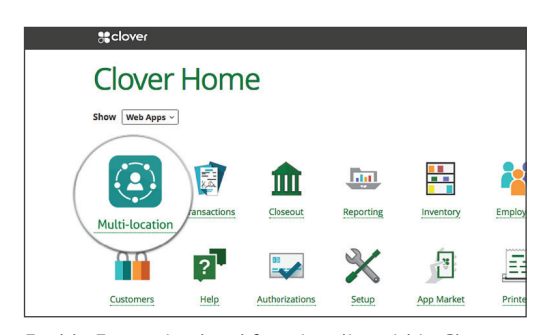
Enable Enterprise-level functionality within Clover

Make real-time pricing, menu and inventory changes across the entire chain, individual stores or a defined group of stores. Create reports. Update inventory Manage employees across the chain or at a store level. This powerful app creates a hierarchical structure that enables numerous features desired by multi-location merchants such as franchise organizations (QSRs, restaurant chains) and retailers.