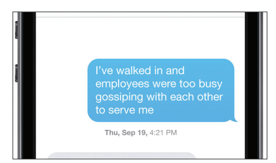
You and others in your organization, can receive messages via email or SMS. No app needed. Respond immediately for best results.