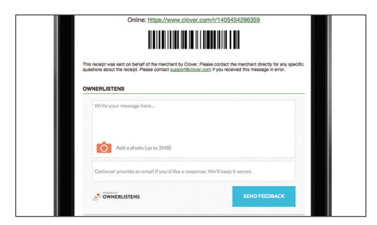
Install the OwnerListens app from the Clover App marketplace

Give customers an easy way to communicate with you via email, instant messaging or print receipts. You or your managers can reply immediately to intercept potential bad reviews and answer questions about your product or service. Our dashboard and reports help monitor your online reputation and hold employees accountable for events occurring on their watch.