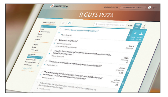
Reply to messages, generate reports, change settings and add additional responders from the dashboard, accessible on any browser